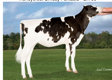
REASON'S Maternal Sister Fullthrottle Medley Music Sold for $31,000 in the 2018 World Classic Sale