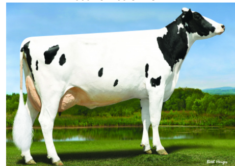
566HO1293 SEASAW Dam: Ladys-Manor SSH Seashell-ET "VG-85"