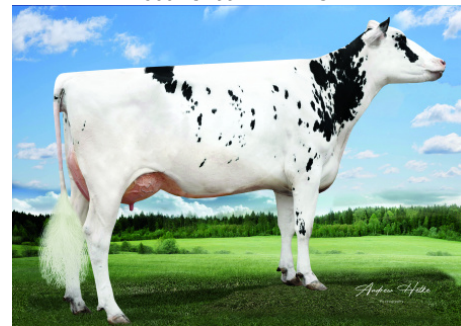
566HO1332 WHY NOT Dam: Melarry Frazzled 2873-ET "VG-85"