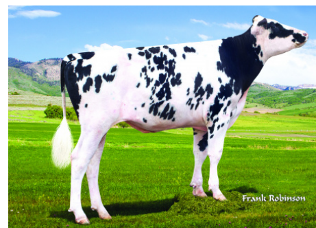
566HO1332 WHY NOT

Sire: Fustead S-S-I Solution-ET Dam: Melarry Frazzled 2873-ET "VG-85" 3-09 2x 365d 32,810 4.2 1393 3.2 1055 MGS: Melarry Josuper Frazzled-ET MGD: Melarry Damaris Whilma-ET "EX-90" 3-07 2x 365d 35,780 3.8 1352 3.2 1159 Life: 1273d 118,070 3.7 4418 3.2 3822 3rd Dam: Melarry Shan Whinn-ET "VG-85" Life: 1780d 144,420 4.1 5974 3.4 4912 6-03 2x 365d 32,560 4.5 1462 3.3 1003 4th Dam: Butz-Butler Snow Whitney-ET "VG-85" 2-02 3x 365 34,610 4.5 1560 3.2 1110 5th Dam: Gil-Gar Jeeves Winnie "GP-83" 4-01 3x 305d 28,300 4.1 1155 3.3 942 6th Dam: Gil-Gar G-Wyn Wensday-ET "GP-80" DOM