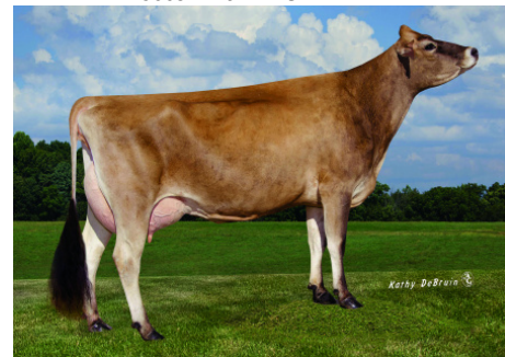
566JE110 VALUABLE-PP Dam: Ahlem Viabull Vanity 5057-P "VG-87"